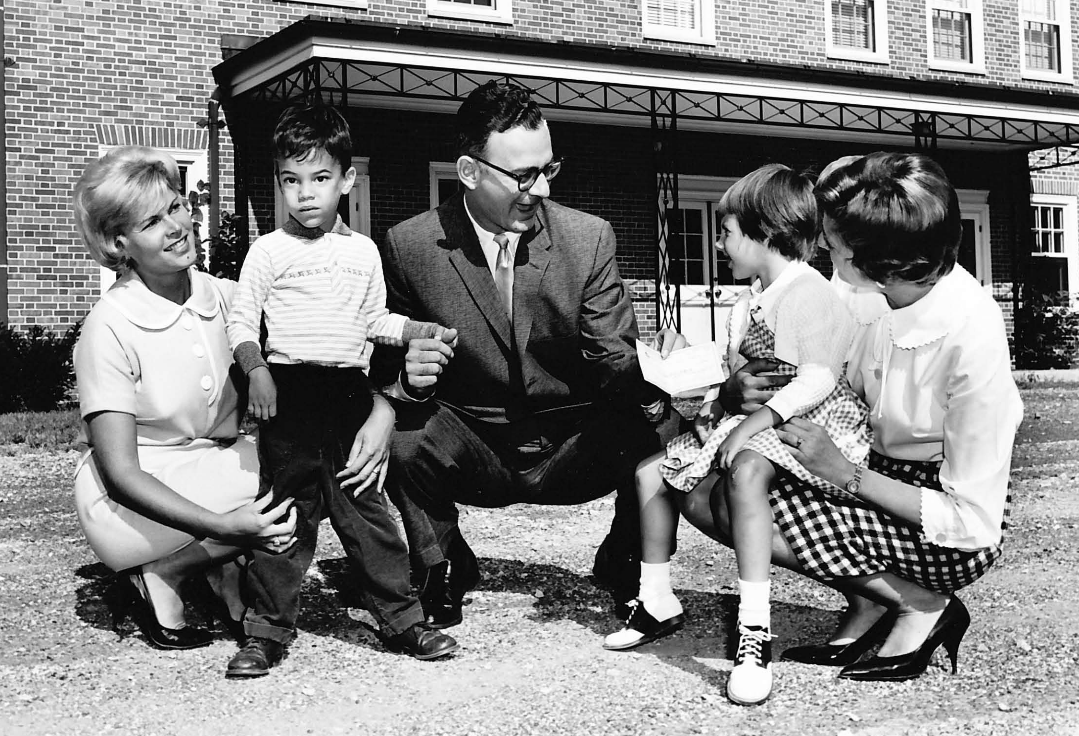
In the early days, the St. Louis Arc was a grassroots organization of parents who believed their children could live fulfilling lives out in the community rather than shuttered away in institutions.