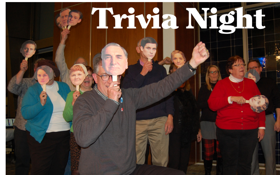
The "Downton Abbey" table took home first place.

The St. Louis Arc's 12th Annual Trivia Night received a standing ovation for raising more than $26,000! More than 600 people took their seats at St. Louis University High School on Friday, January 22 for a trip 'Around the World'. Thanks to the generosity of Anheuser-Busch, Coca-Cola, and Whole Foods Market, the Arc's trivia attendees enjoyed free food and drinks throughout the evening.