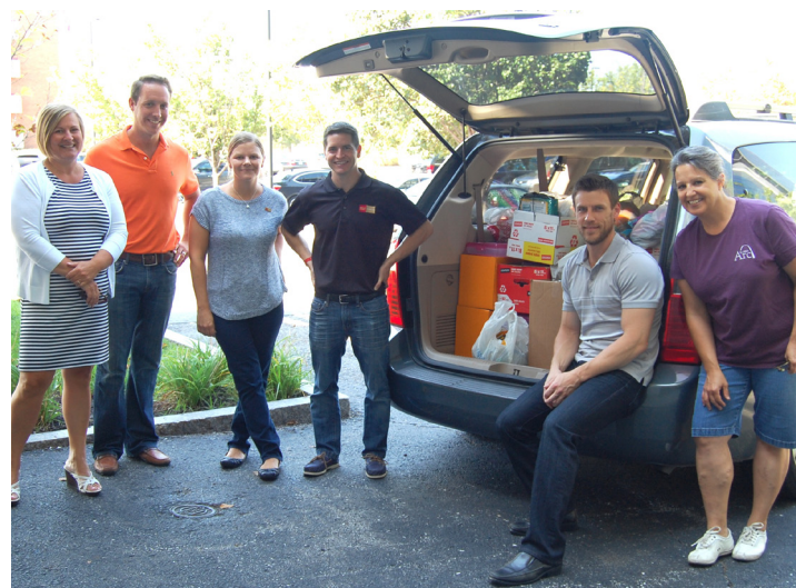
Right: Employees from Wells Fargo Advisors and the St. Louis Arc fill up their cars with supplies.

No child should ever have to worry about whether they will have enough school supplies to last throughout the year. Thankfully, our friends at Wells Fargo Advisors felt the same way. For the second year in a row, they raised more than $4,000 in school supplies and cash donations for children involved in St. Louis Arc programs. The St. Louis Arc is grateful to Wells Fargo Advisors for helping our children be prepared for their first day of school.