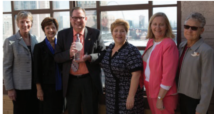
CQL presents the Award of Excellence to St. Louis Arc and SUCCEED.