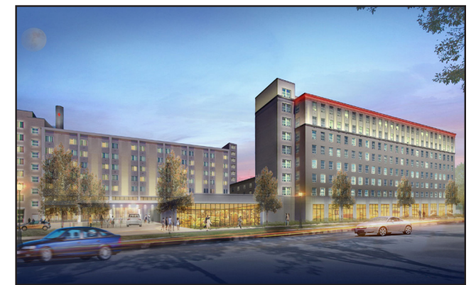
Artist rendering of the Delmar DivINE